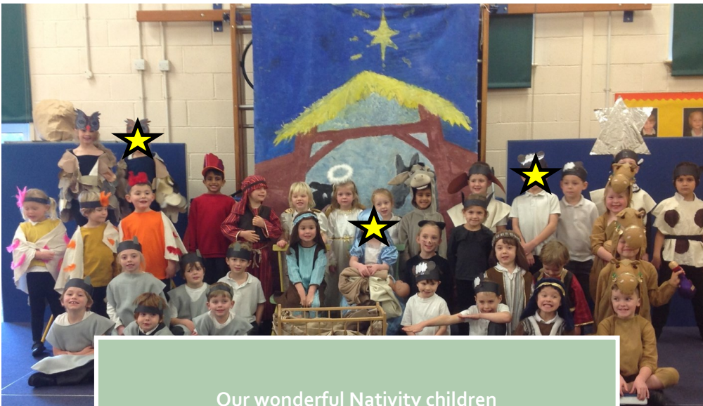
Our wonderful Nativity children