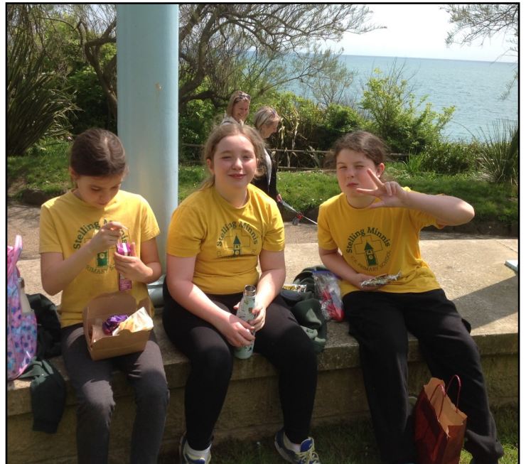
Lunch, in the sunshine, on the Leas.