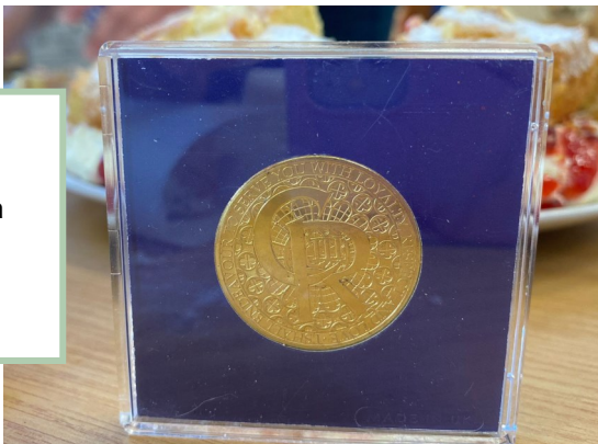
Every pupil took home a coronation coin.